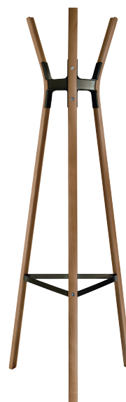
Finish Frame: American Walnut Joints: Black 5140