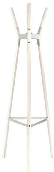
Finish Frame: Beech Painted White Joints: White 5108