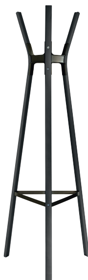
Finish Frame: Beech Painted Black Joints: Black 5140