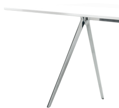
Indoor use Frame: Polished